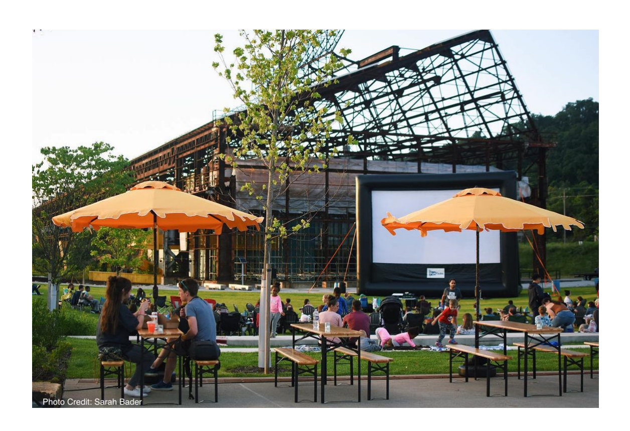
Plaza News and Happenings

To learn more about the Pittsburgh Entrepreneurship Platform, click here.